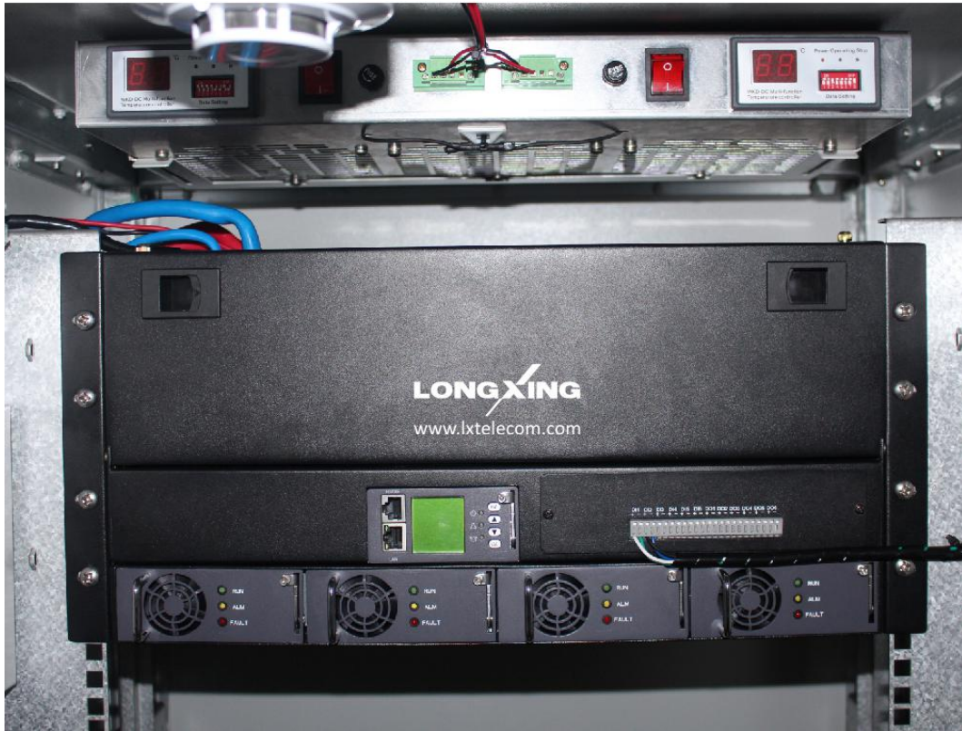
Switching mode power supply