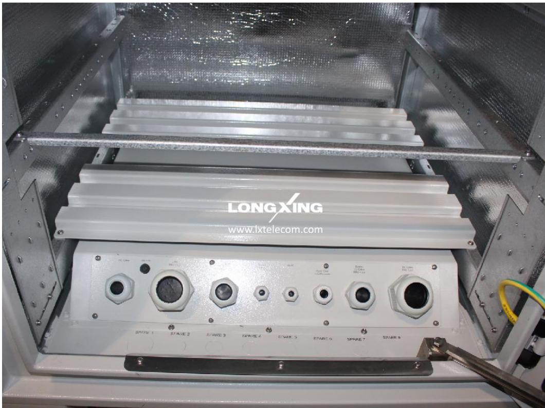
Cable glands & punch holes & battery support