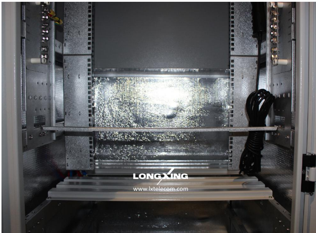
Battery space & 5U optional kits