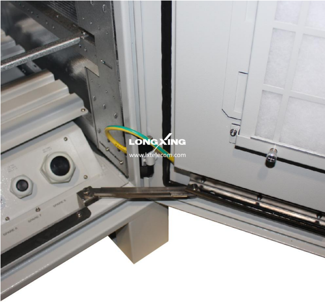
Door stopper 90° + 120°