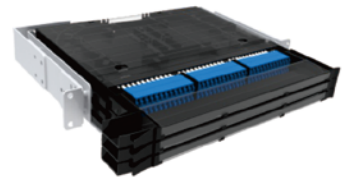
HD Patch Panel