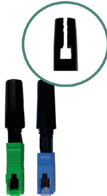
Type B, BS Press-Fit Structure