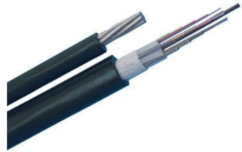
SSW Aerial Cable

Mid-span access is easily conducted by instruction shown in right figure. Self-supporting wire will still maintain the cable properties after the mid-span access.