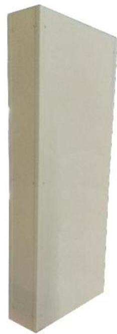
Back view with door closed