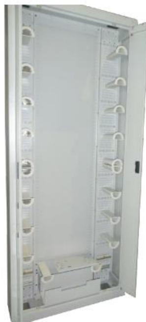
Front view with door open