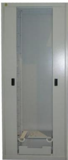
Front view with door closed